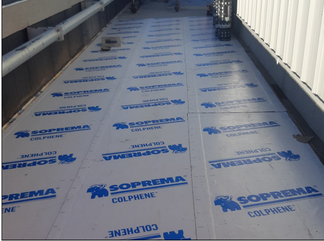
Installation of vapour barrier