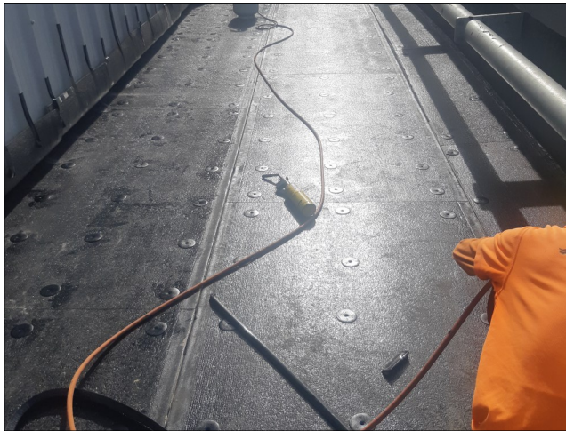
Installation of roof cover board and primer