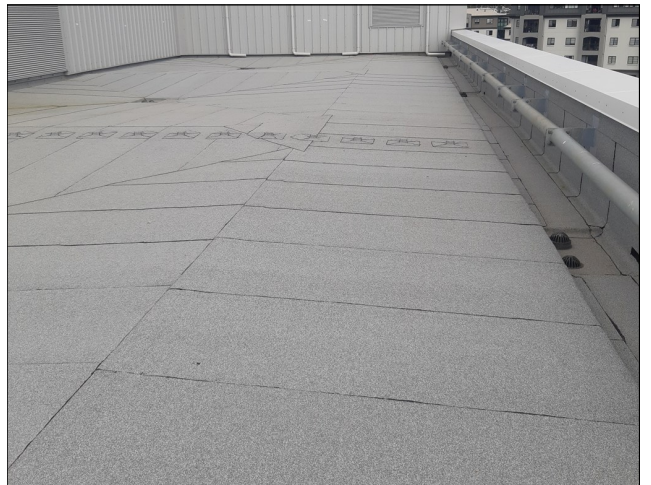
Installation of SOPREMA DUO two-layer system