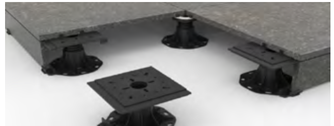
LD0001 Lateral Disc