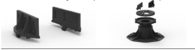
WC9801 Basic Parallel Connector

Connected to the basic disk (1 or 2 pieces can be used), the basic parallel connector creates a connection for parallel, wooden or deck flooring to the pedestal feet. Compatible with BS60, SL60, SL110 and SLW110 Series.