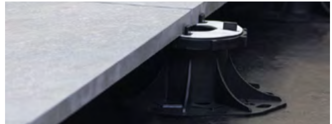
DC9801 Basic Disc