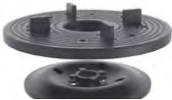
SLC001 Maxi SL Disc Pad

A self-levelling disc for connection to basic parallel connector and 2mm-4mm tabs. Compatible with SL60, SL110 and SLW110 Series.