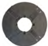
W14001 Maxi Raft Disc

Maxi raft disc pad and adjustable beam joint connector for use in raised floor applications using wood or aluminium joists. Beam joint connector is adjustable for desired length. Compatible with SL110 and SLW110 Series.