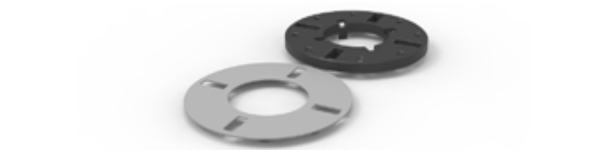
HC9801 Basic Rubber Shim

Basic disc for connection to basic parallel connector and 2mm-4mm tabs. The Rubber Shim is attached to the disc as a contact between the tiles/beams and the pedestal to prevent unwanted sounds. The Rubber shim can also be used to compensate for 1mm discrepancies between tiles. Compatible with BS60 Series