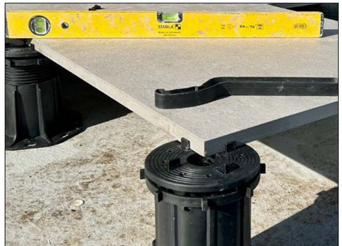
Adjustment tool used for levelling tiles