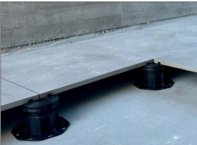
Perimeter tiles installed