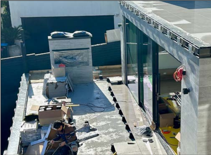
Fixplus pedestal setup