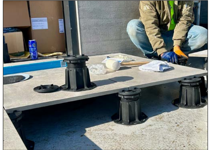
Perimeter tiles being installed