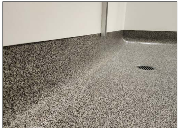
Finished cove detail