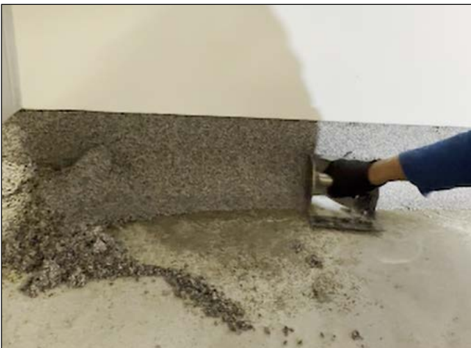
Forming a cove detail