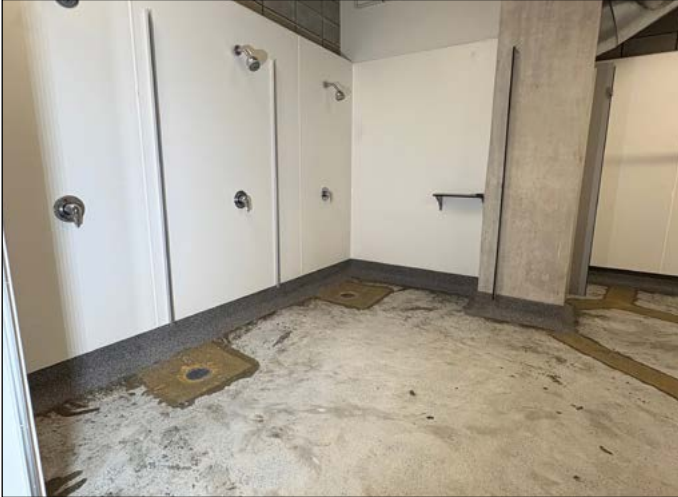
Concrete preparation and detailing