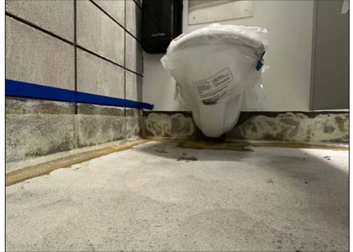
Concrete preparation and detailing