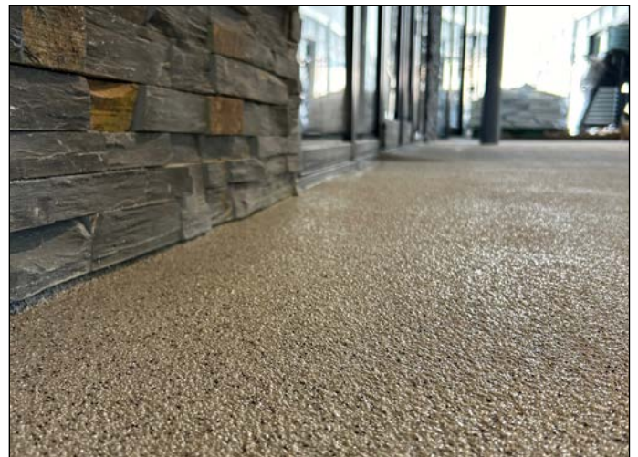
Decorative quartz aggregate broadcast