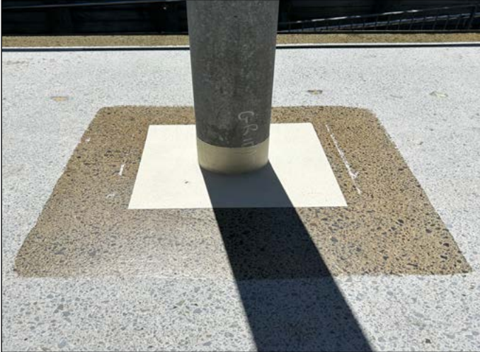
Area prepared and detailing coats installed