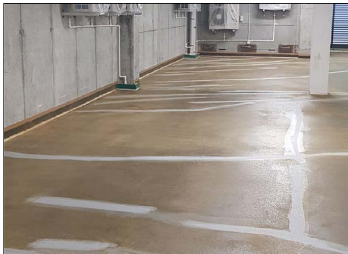
Matacrl LM used to fill cracks after priming