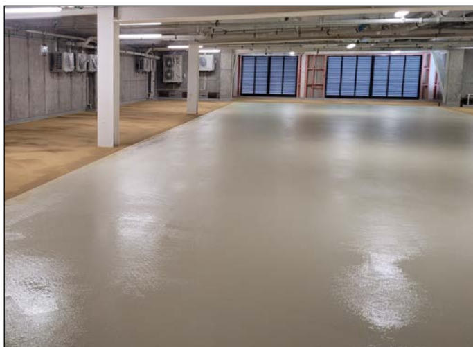
Wear layer before topcoating