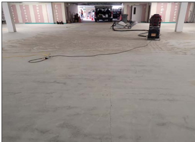
Substrate prepared with grinding