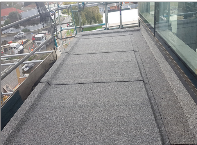
Completed DUO membrane to balconies