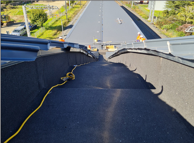
Installation of DUO cap sheet to gutter