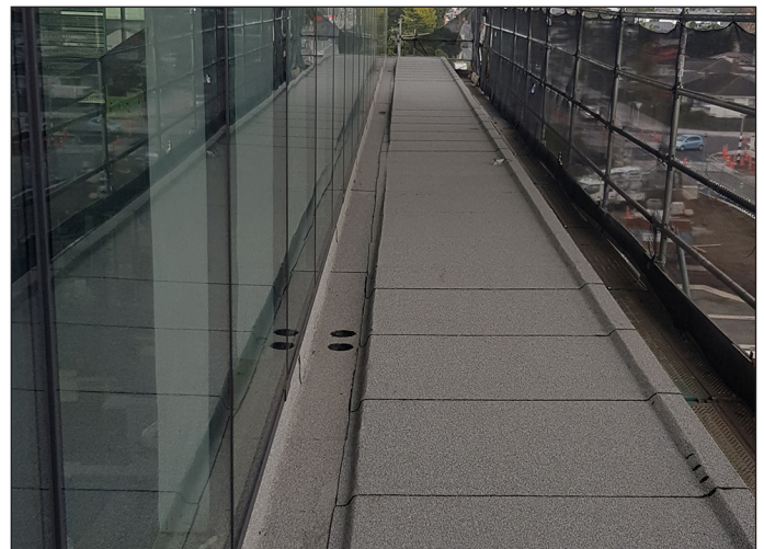
Completed DUO membrane to balconies