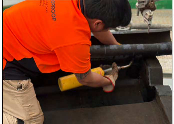
Application of DUO (Noir) capsheet to parapets and gutters