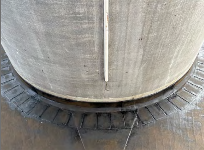
Detailing of base sheet to circular posts