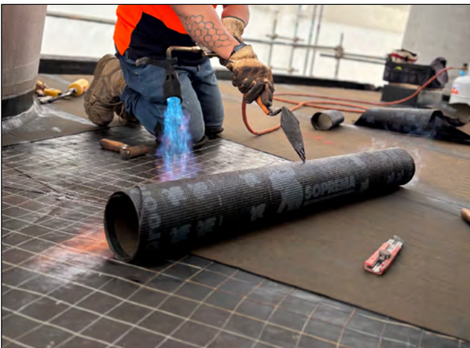
Base sheet being torched to primed substrate with ILD mesh