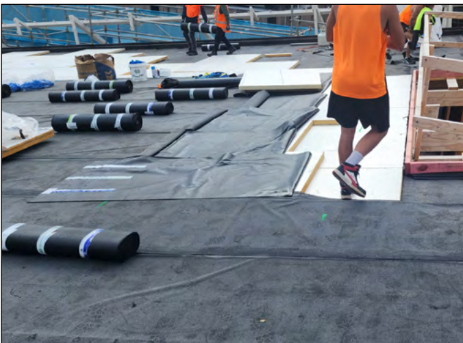
Base sheet mechanically fastened over Equus PIR insulation