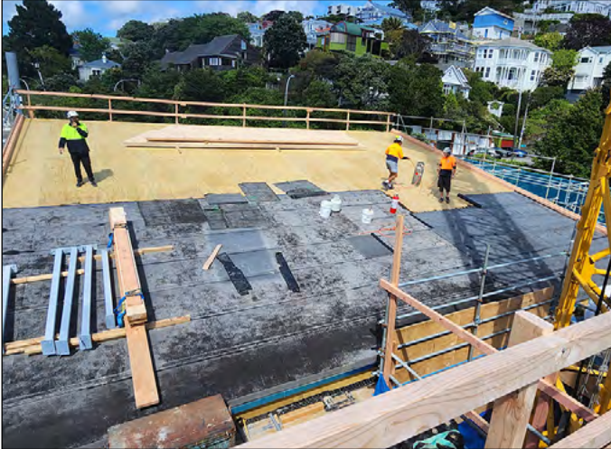
Vapour barrier installed over plywood substrate