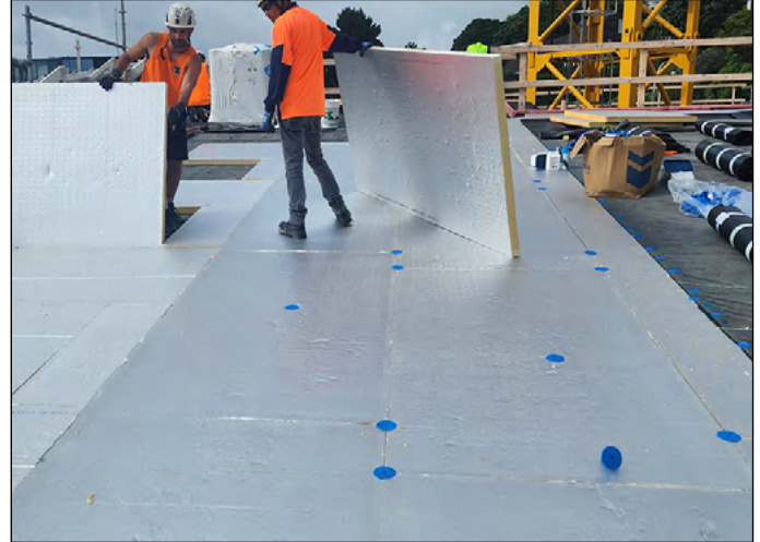
Equus PIR installation