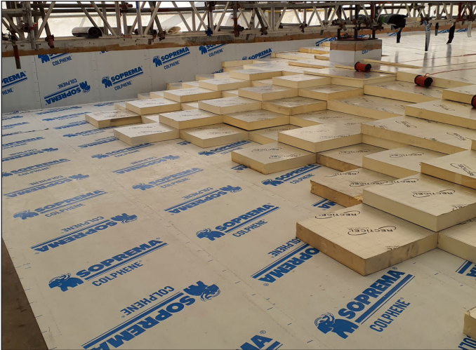
Self-adhesive COLPHENE vapour barrier over concrete substrate