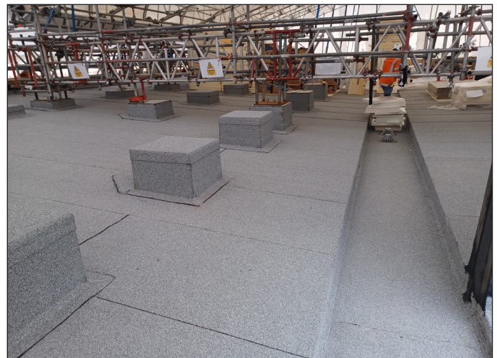
Cap sheet application