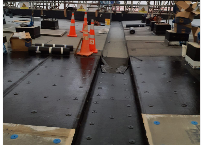
Roof board mechanically fastened with primer applied on top