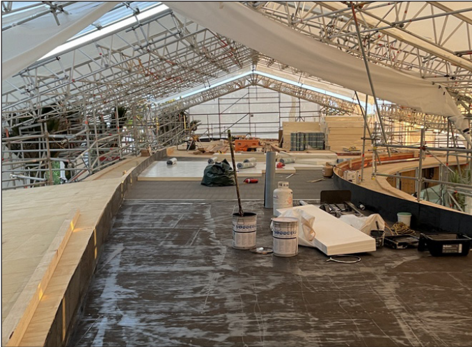
Primer applied to substrate