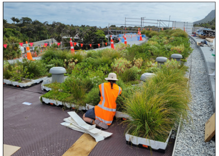
Drainage mat and greenery modules installed over membrane