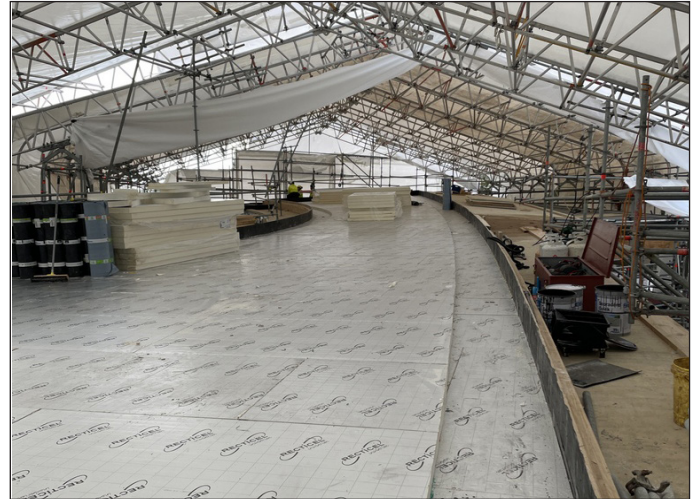
Installed PIR insulation