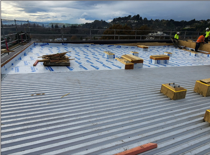
Vapour barrier over metal substrate