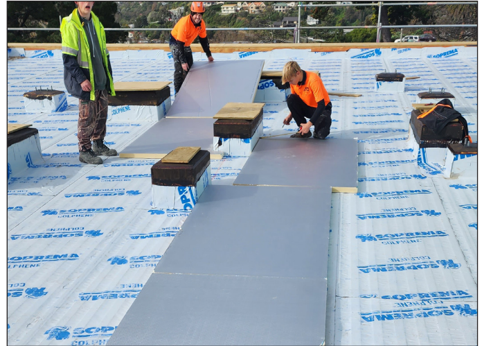
PIR insulation being installed