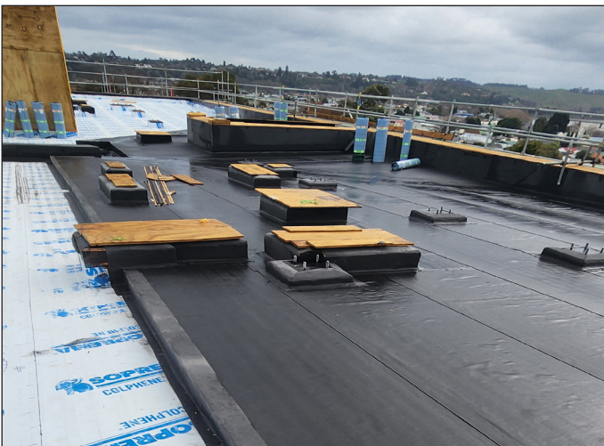
Base sheet over PIR and vapour barrier