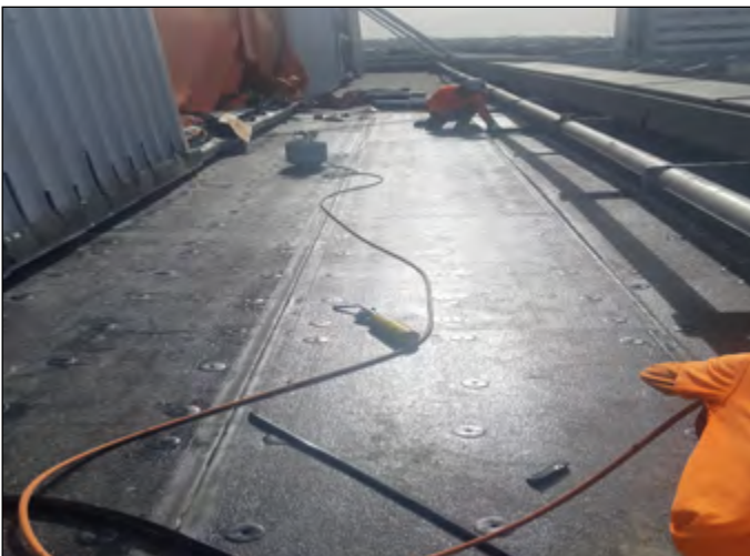
Installation of roof cover board and primer