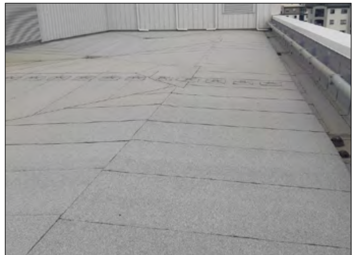
Installation of SOPREMA DUO two-layer membrane system