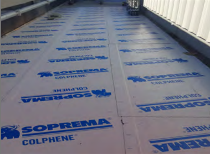
Installation of vapour barrier