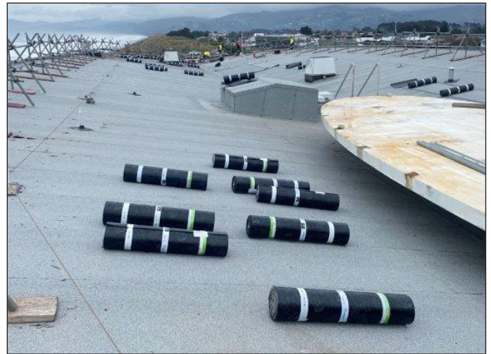
Installation of DUO cap sheet