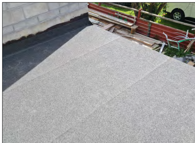
Easy malleable APP membranes available in torch applied and self adhered