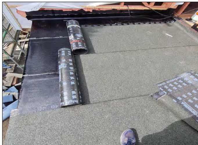
Equus cap sheet torch applied