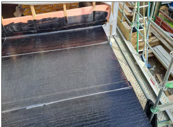
Equus Nova-SK Flameless self adhesive base sheet for quicker installation