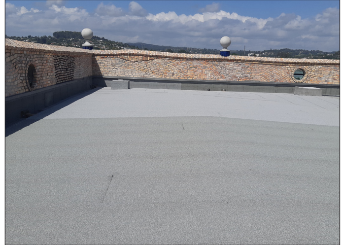
Warm roof completed after two-layer DUO Landscape application