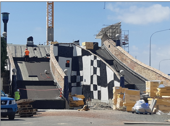
Ramp waterproofing underway