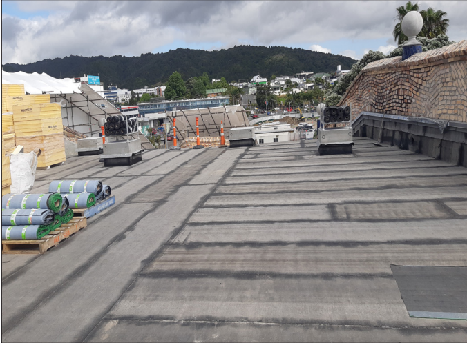
Vapour barrier installation