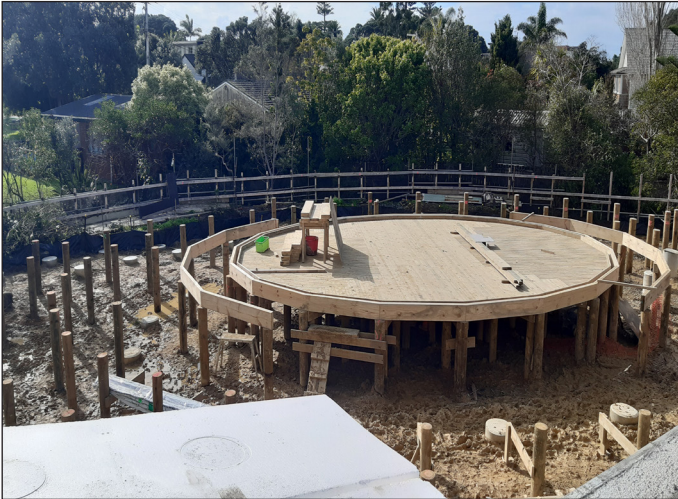
Structure coming out the ground