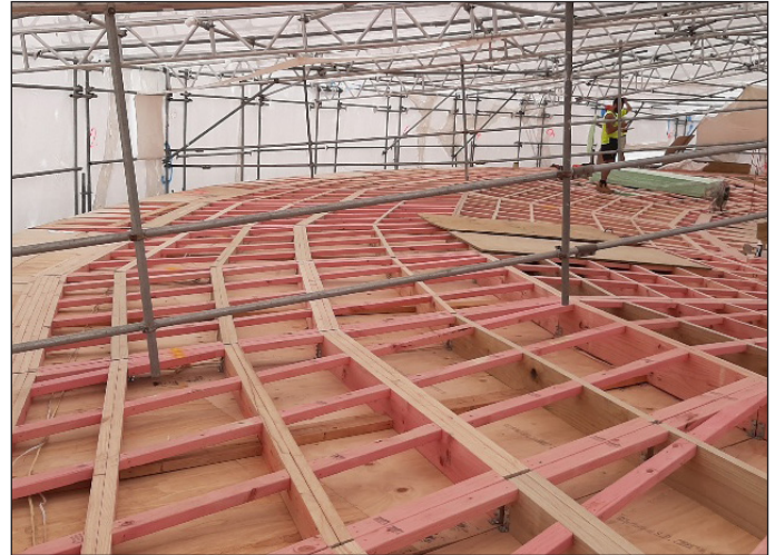
Roof structure going up