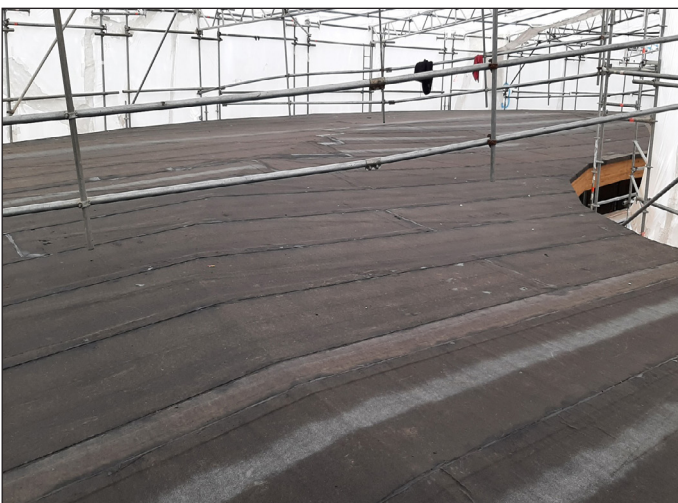
DEBOPLAST base sheet being applied