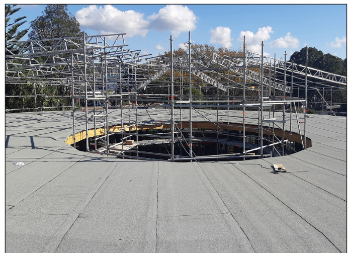
DUO Landscape cap sheet applied