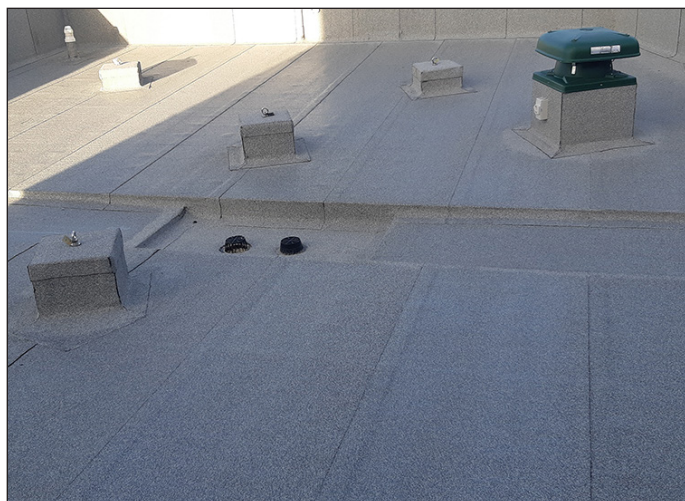
Completed DUOTHERM Warm Roof showing detailing