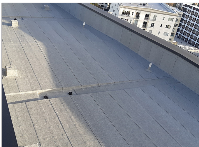
Completed DUOTHERM Warm Roof