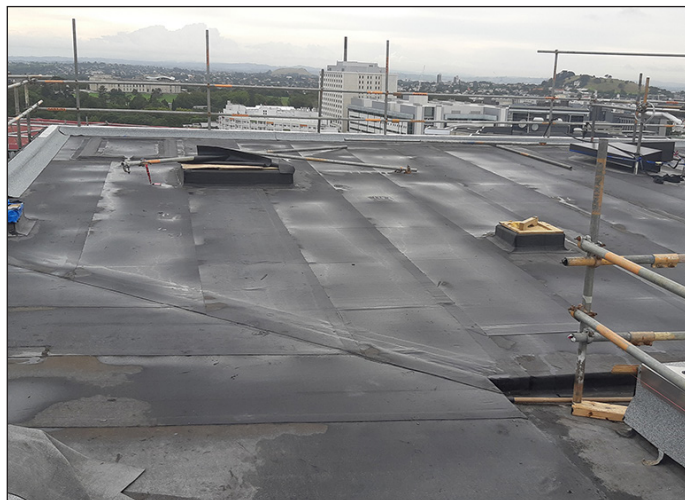
Installation of DUO base sheet over PIR