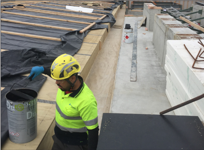
Primer application on plywood substrate