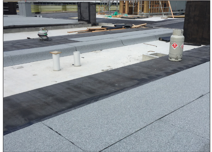
Soprema DUO cap sheet installation