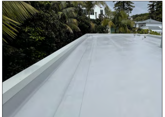
Application of first layer of topcoat over cured EASY FLASHING