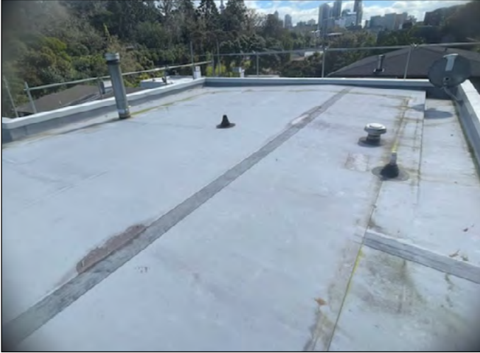
Existing butynol roof was showing wear and blistering