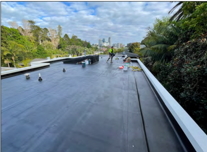
Application of EASY FLASHING with fibreglass reinforced on laps