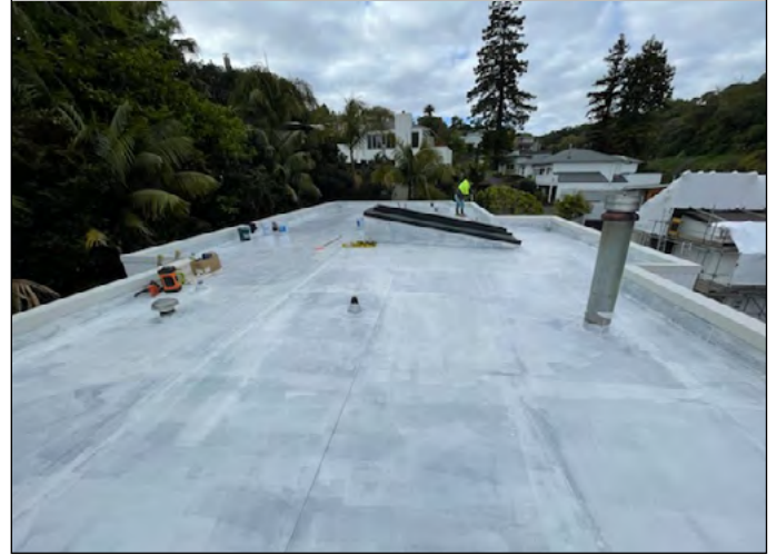
Application of Epistixx Primer