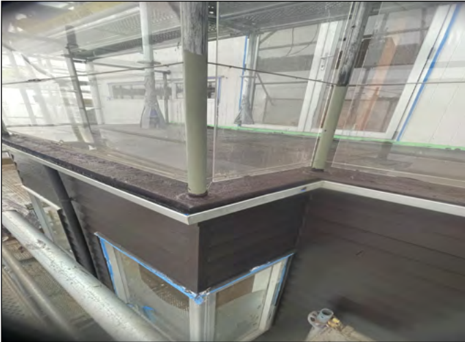
Waterblasting of existing deck and allowed to dry