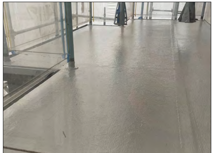
Application of first layer of topcoat over cured EASY FLASHING