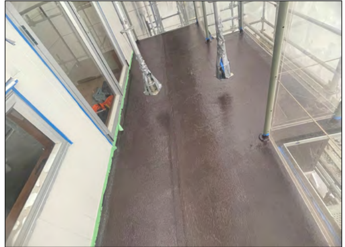
Application of first layer of EASY FLASHING with reinforcement