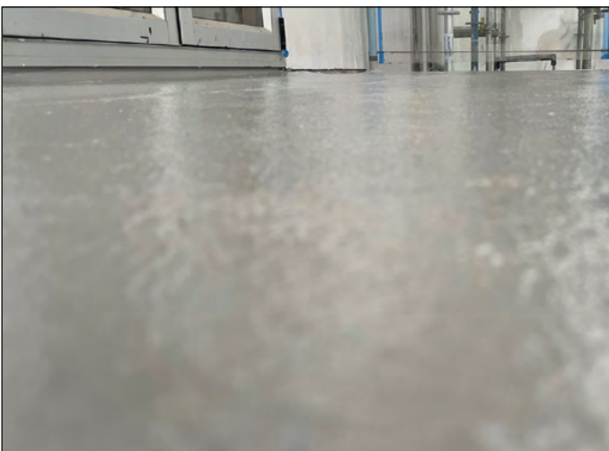
Final result after applying second layer of topcoat