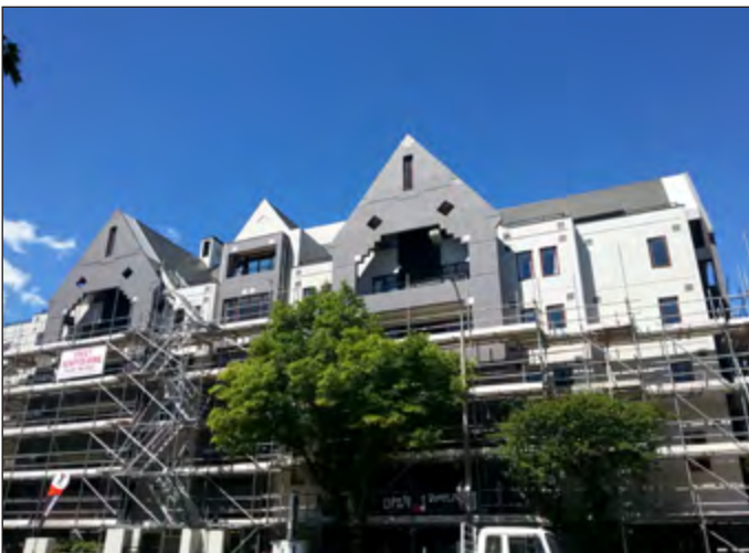
Application of Troweltexx 2000