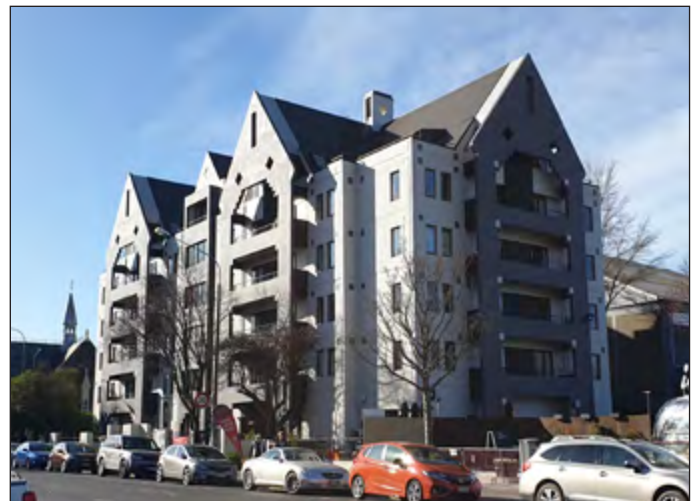
Colourglaze topcoat finished