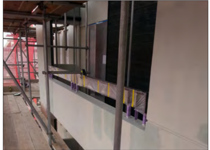
Surface primed with Coverall Sandy