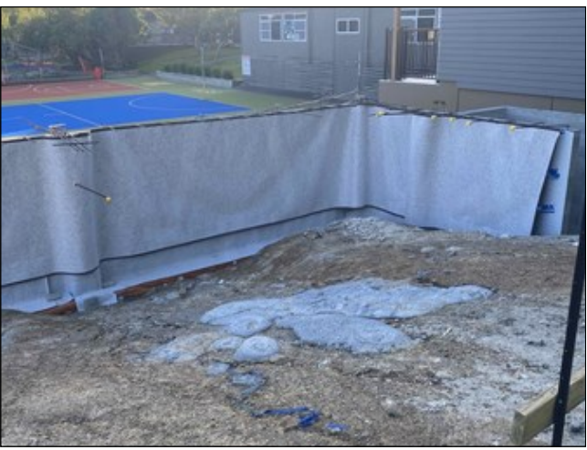
Installation of Equus drainage, filter and protection layer