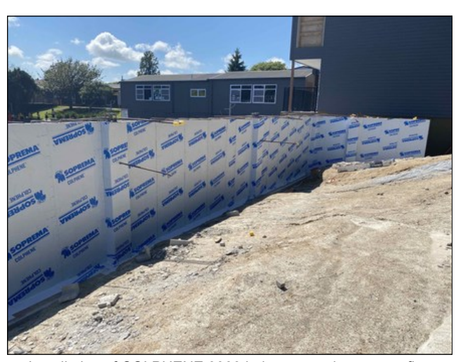
Installation of COLPHENE 3000 below-ground waterproofing

Email: info@equus.nz Website: www.equus.nz