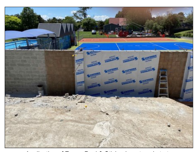
Application of Equus Peel & Stick primer to substrate