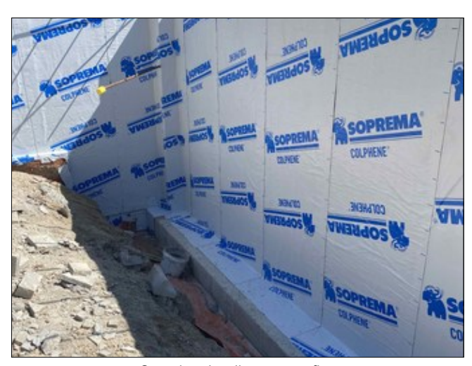
Completed wall waterproofing