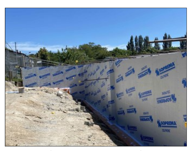
Connection of COLPHENE 3000 waterproofing membrane to DPM