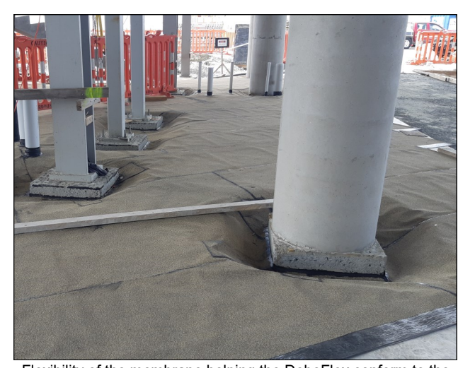
Flexibility of the membrane helping the DeboFlex conform to the substrate