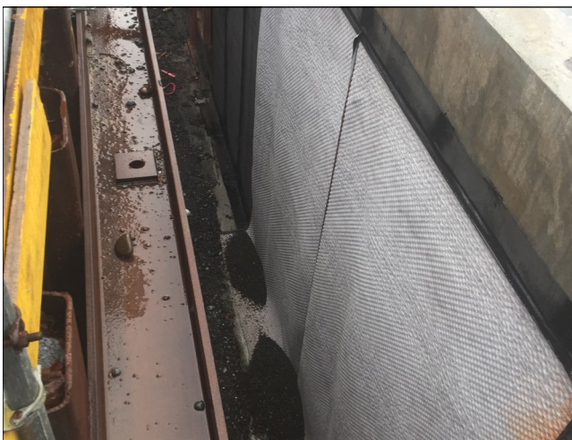
Walls being protected by Danodren H15 protection and drainage mat before back filling