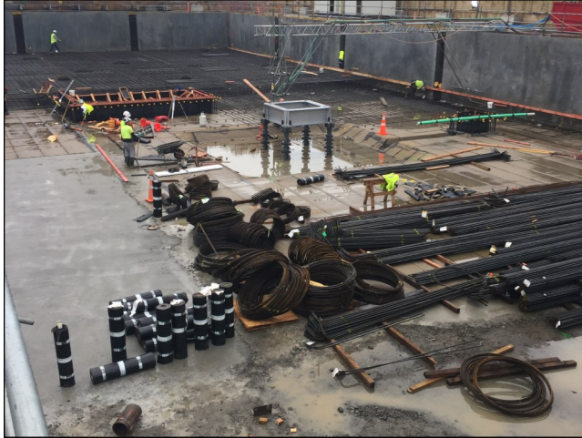
Underground site slab ready for DeboFlex 3.5 Special