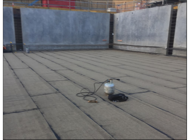
DeboFlex 3.5 Special ready for Steel installation