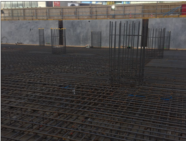
Steel installation on top of DeboFlex 3.5 Special