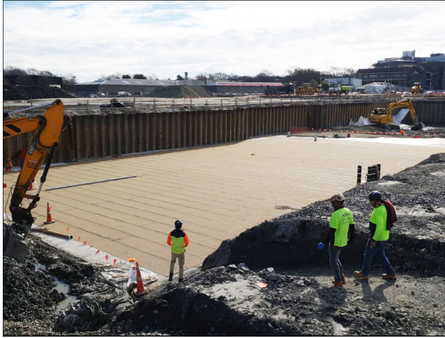
DeboFlex 3.5 Special laid to site slab ready for steel work