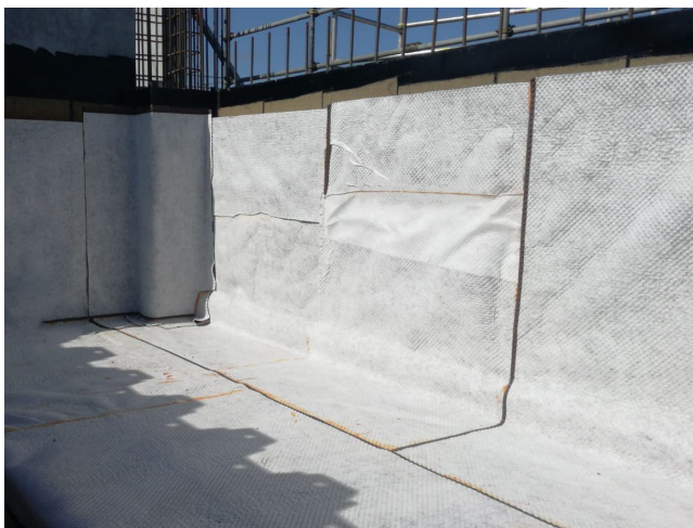
Danodren H15 protection and drainage layer ready for backfill