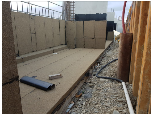
DeboFlex 3.5 Special to pre-cast panel walls