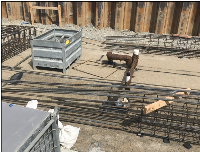
Steel installation commencing