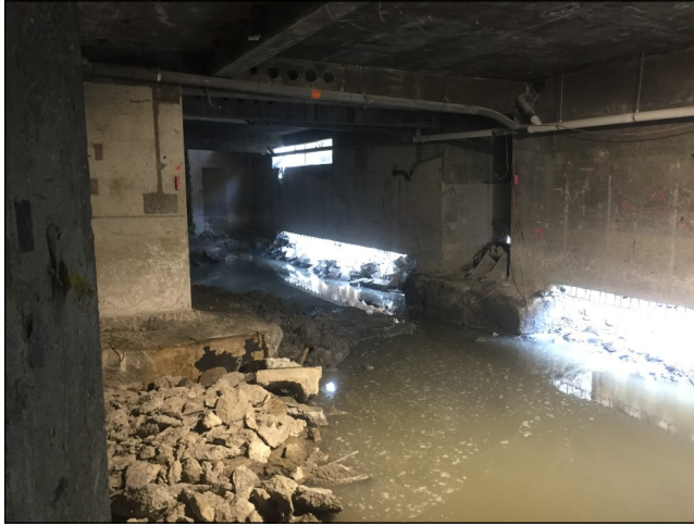
Town Hall underground prior to tanking