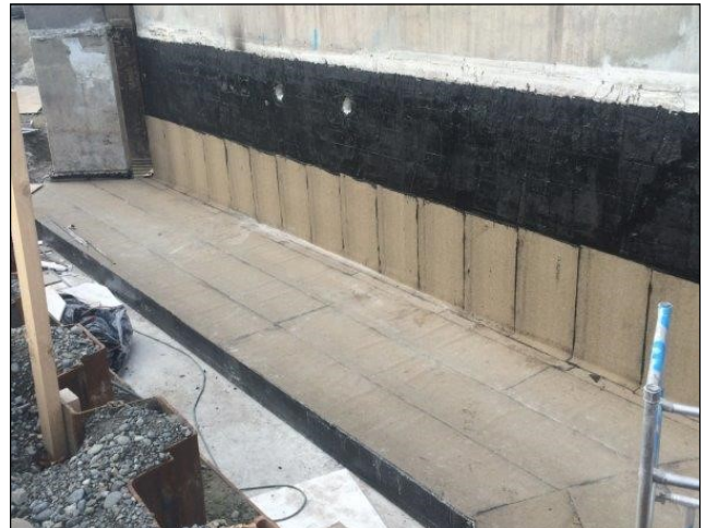
Debobase tanking membrane installed on exterior