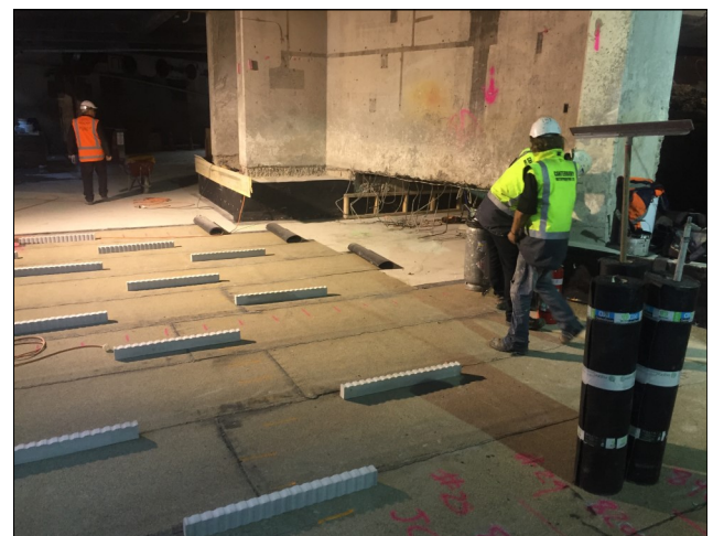
Debobase tanking membrane installed across the internal concrete slab flooring and walls