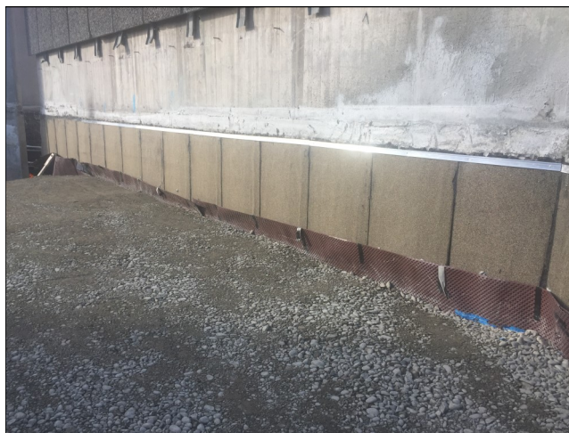
Danosa Danodren H15 Plus protection layer installed against membrane, then backfilled