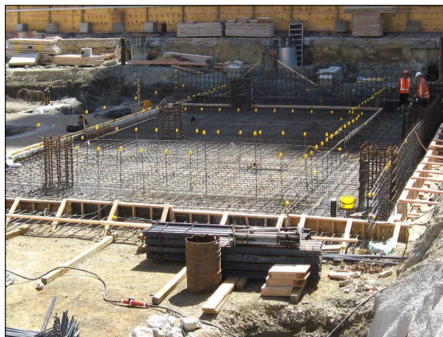
Completed tanking ready for concrete pour