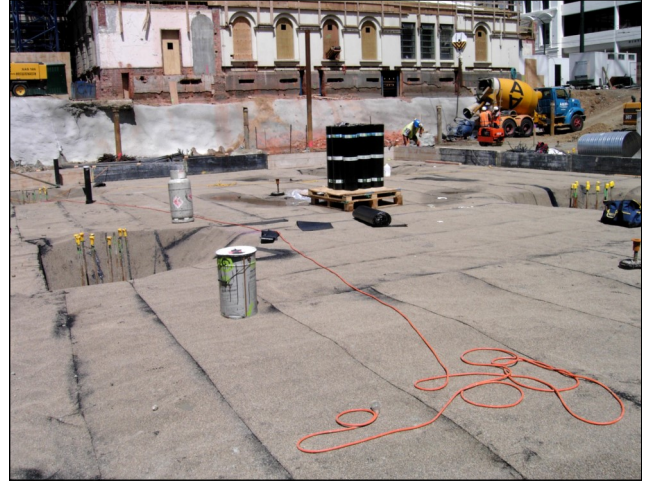
De Boer Debobase installation