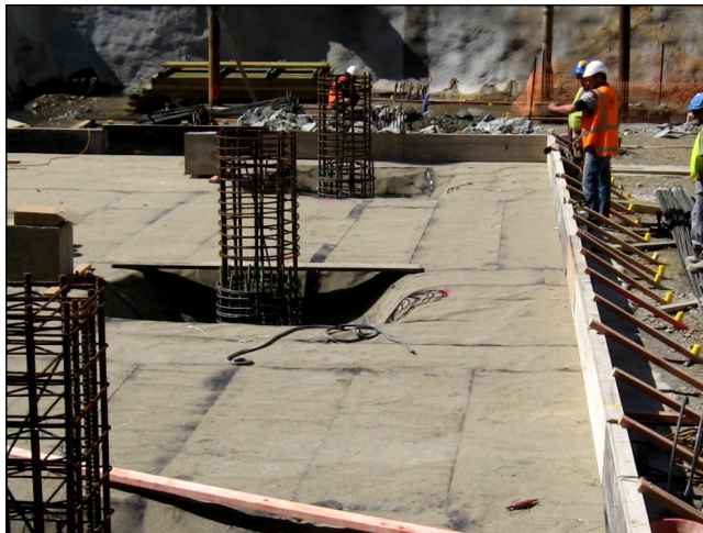
De Boer Debobase installation