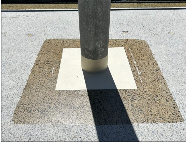
Area prepared and detailing coats installed