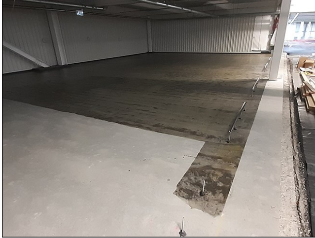
Substrate prepared and primed