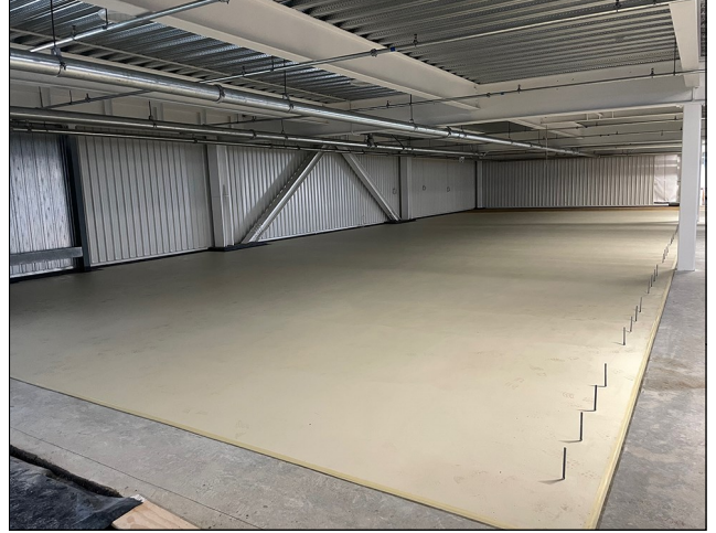
Matacryn Manual membrane layer laid