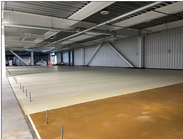
Matacryn Wear layer in foreground