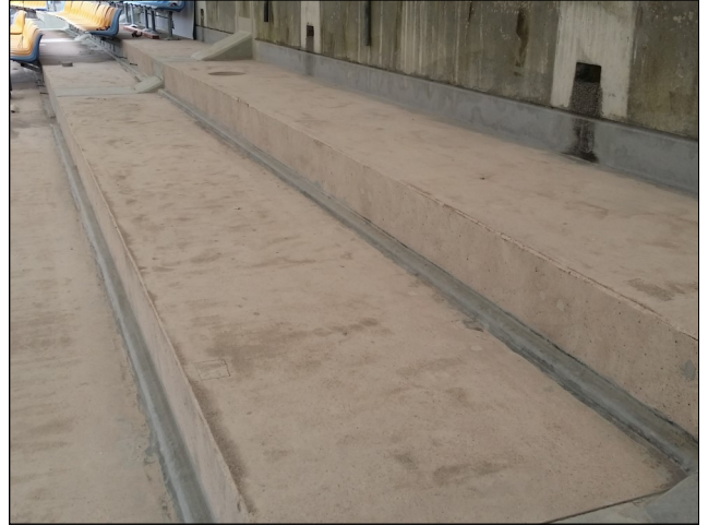
Prepared concrete substrate ready for application