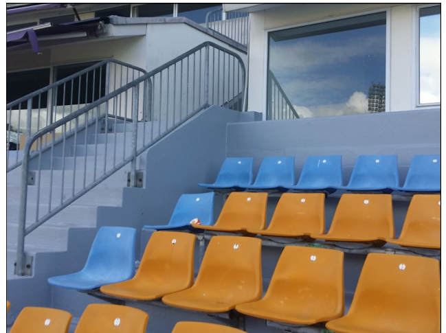
Matacryn Membrane applied to stairs and aisles