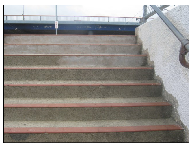
Stairs before Duracon application