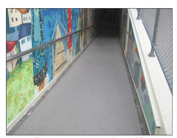
Entrance ramp completed with Duracon BC