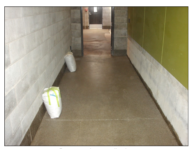
Duracon primer application