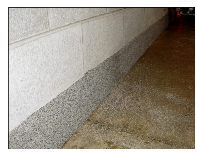
Duracon cove installation