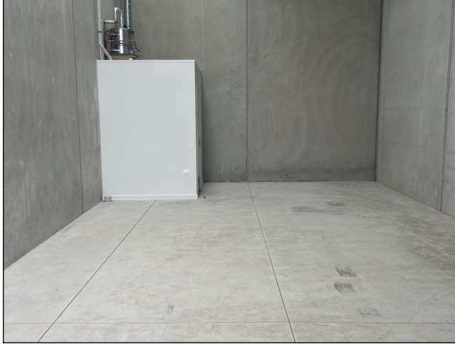
Before — pre concrete preparation