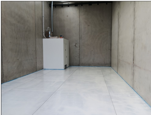
Chevaline Epistixx primer body coat