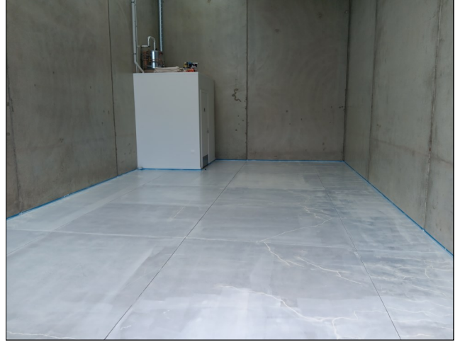
Pre primer — Chevaline Epistixx