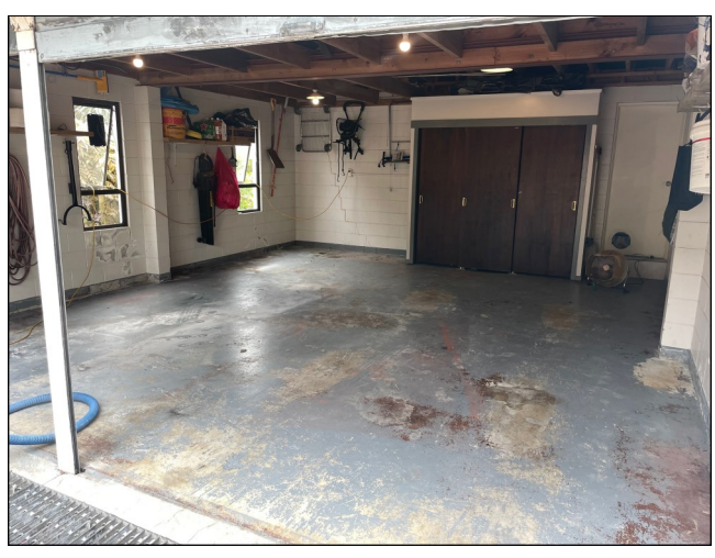
Existing garage floor