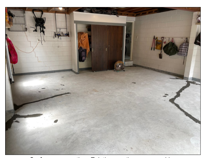
Surface preparation. Existing coatings removed by diamond grinding