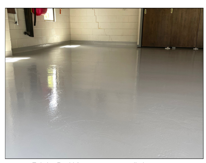
Epistixx Rapid 3x coat system applied to concrete

Project Name: Residential Garage Refurbishment