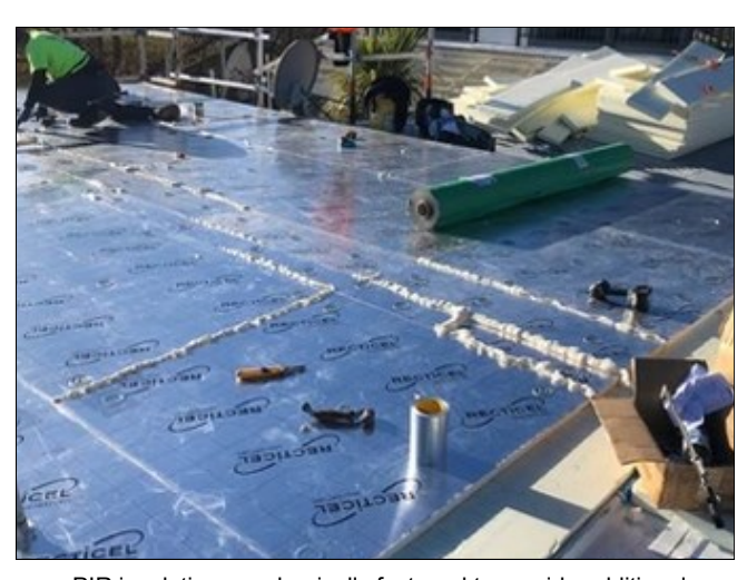
PIR insulation, mechanically fastened to provide additional thermal benefits