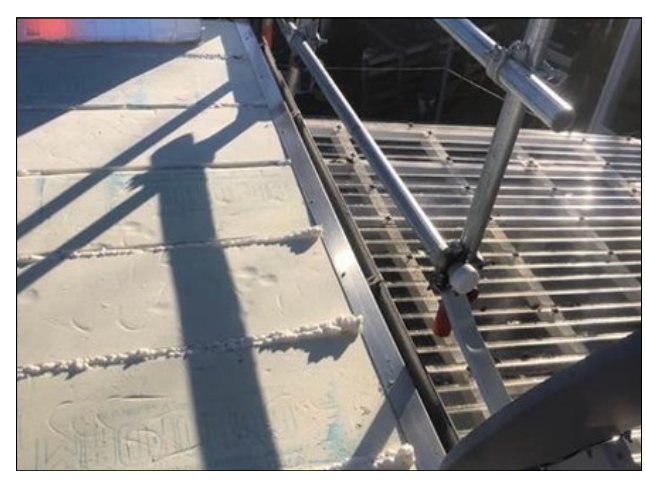
Installation of XPS infills glued between the metal ribs to provide a base for the PIR to be installed