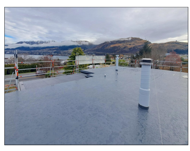
Installation of Flagon TPO waterproofing