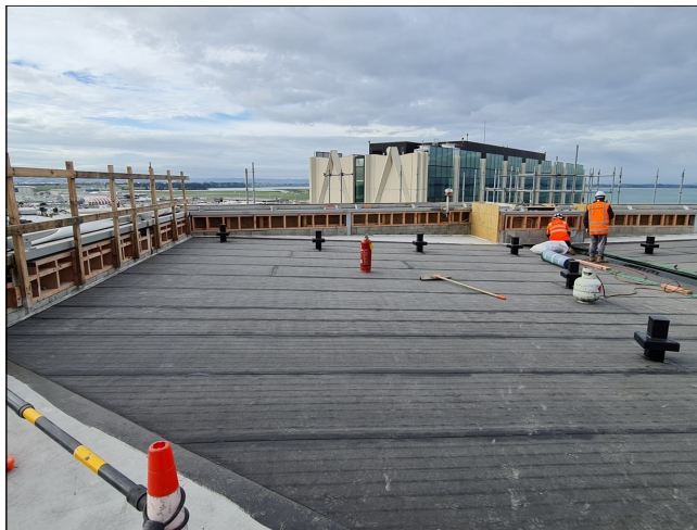
Installation of base sheet