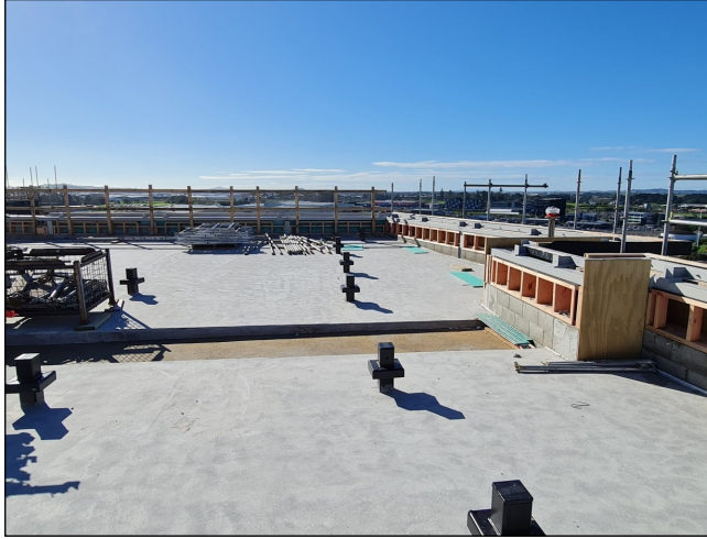
Concrete substrate grind and cured