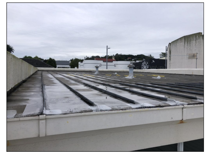
Original iron roof