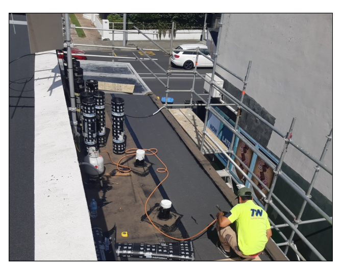
Cap sheet being torched to base sheet

Project Name: Commercial Location: Auckland Project Type: Refurbishment Project Size: 300 sqm System: EQUUS SOPREMA SOPRASUN PLUS Roof System Certified Applicator: Thomassen Waterproofing Ltd