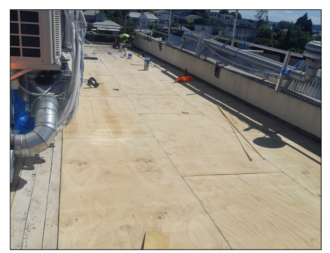
New ply on existing sarking timber

Equus Industries Ltd Email: info@equus.nz Website: www.equus.nz