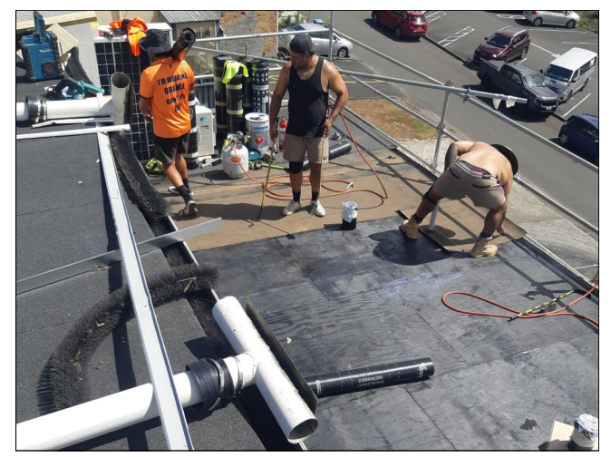
Base sheet torched-on over primer