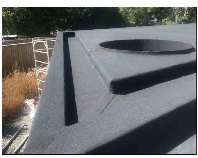
Detailing on the corner of the 'Z' plus planter cut out