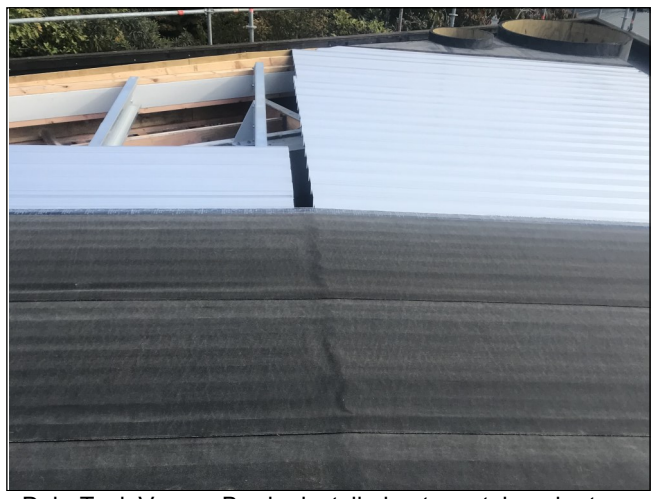
DeboTack Vapour Barrier installed onto metal carrier tray