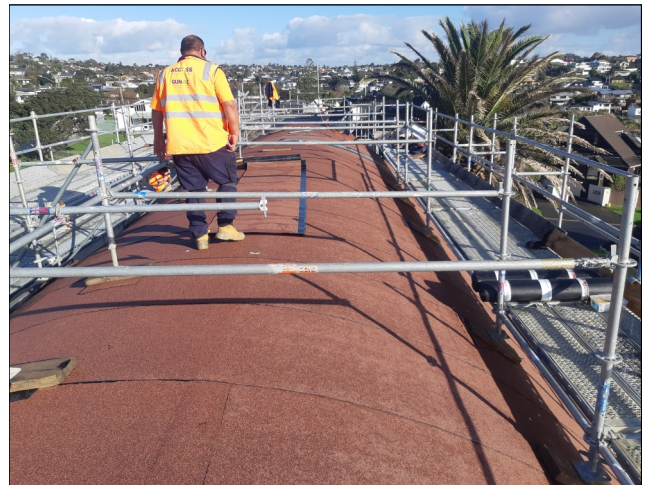
DUO cap sheet laid