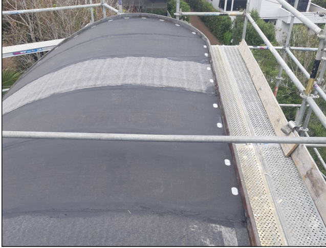
Base sheet mechanically fastened