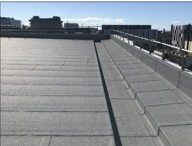
Completed Duotherm roof