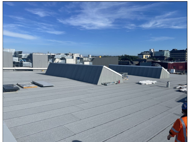
Detailing of DuO cap sheet