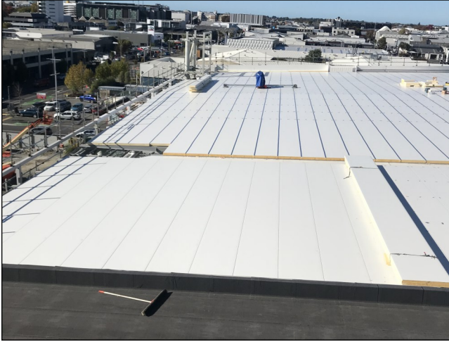
Kingspan substrate being installed