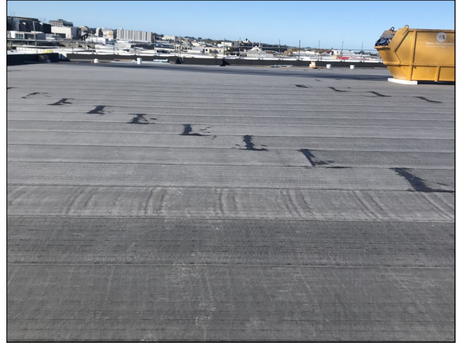
Debotack Aero base sheet being laid