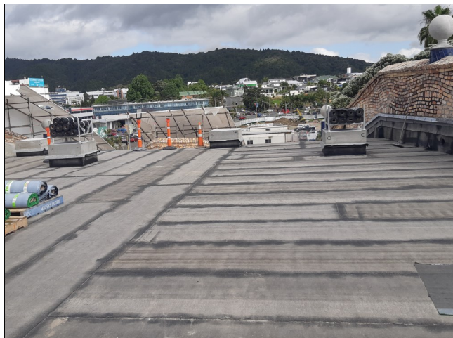
Vapour barrier installation