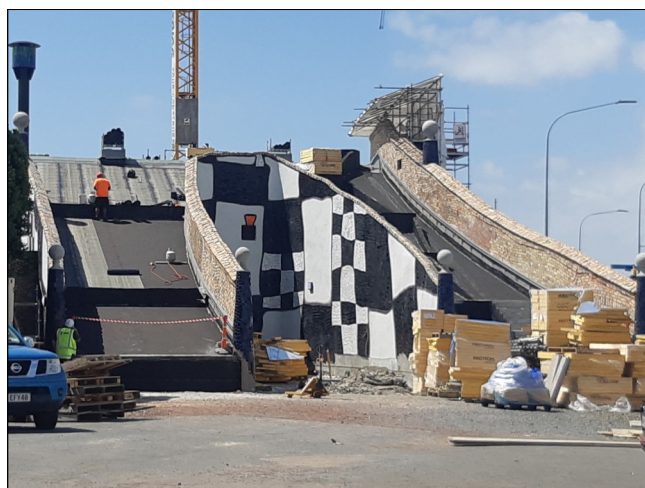
Ramp waterproofing underway