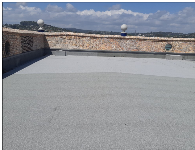
Warm roof completed after 2-layer Duo Landscape application