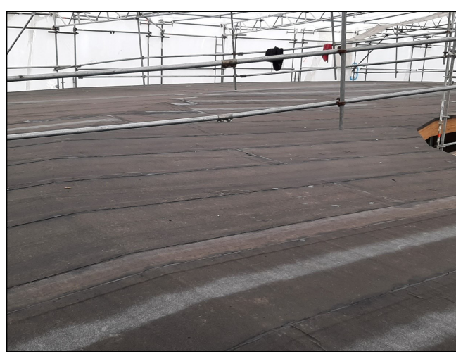
DeboPlast base sheet being applied