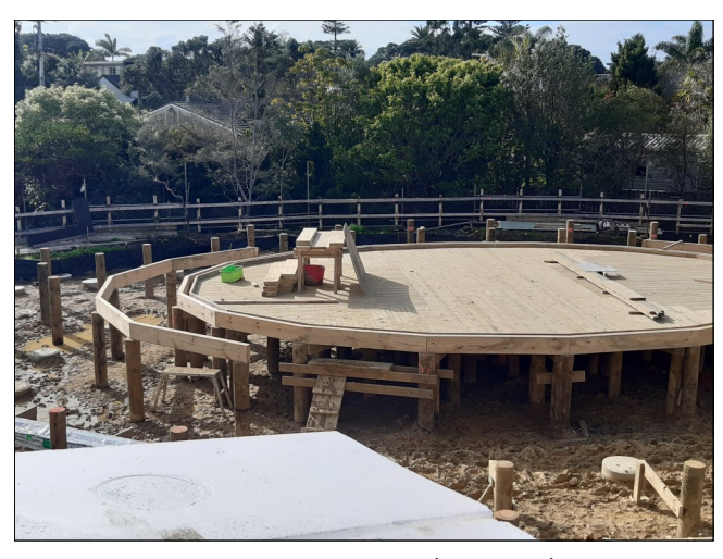
Structure coming out the ground