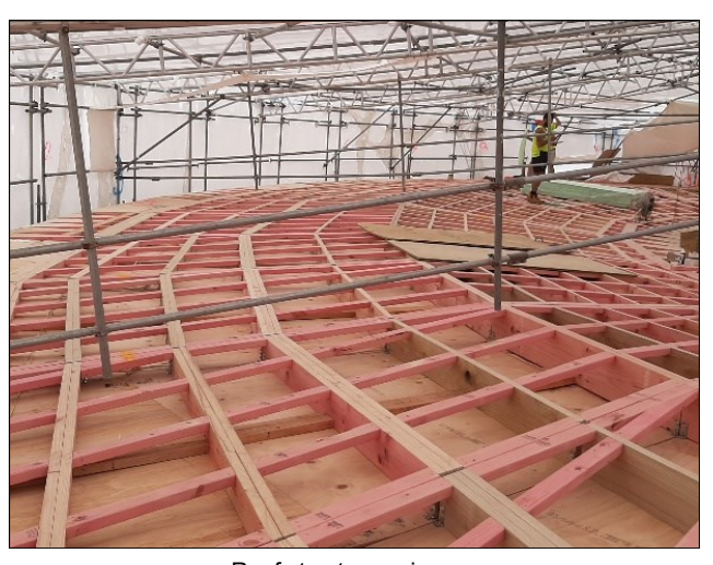
Roof structure going up

Email: info@equus.nz Website: www.equus.nz