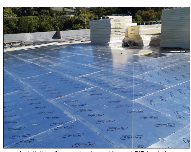
Installation of vapour barrier and thermal PIR insulation

Email: info@equus.nz Website: www.equus.nz