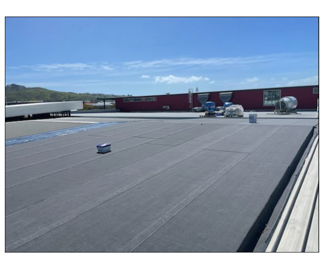
SOPREMA Debotack Aero Basesheet Installation