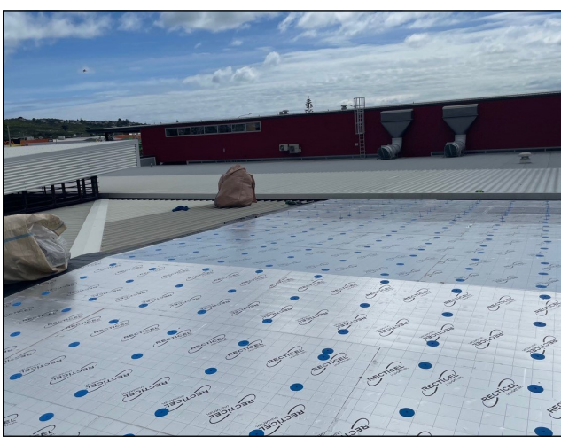
81mm Equus PIR Insulation Installation with Guardian Fastening System

Email: info@equus.nz Website: www.equus.nz