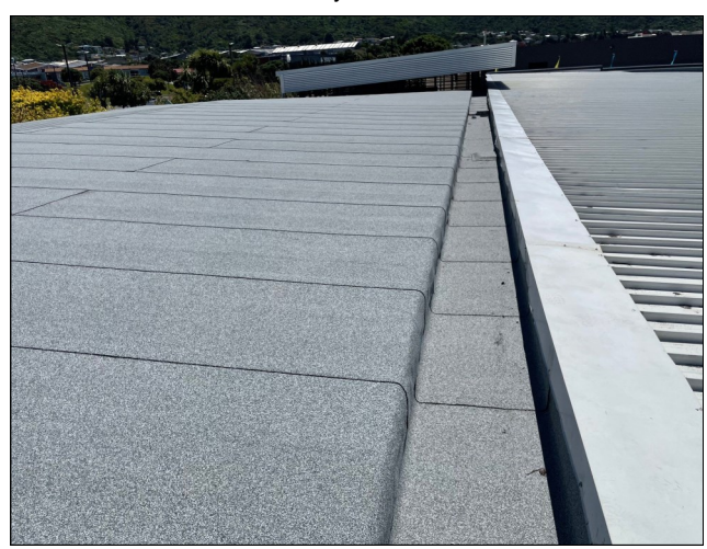
SOPREMA DuO Capsheet Grey/White Installation