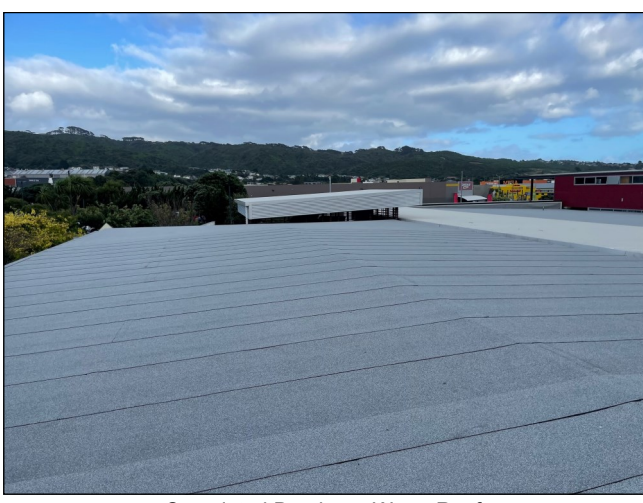
Completed Duotherm Warm Roof