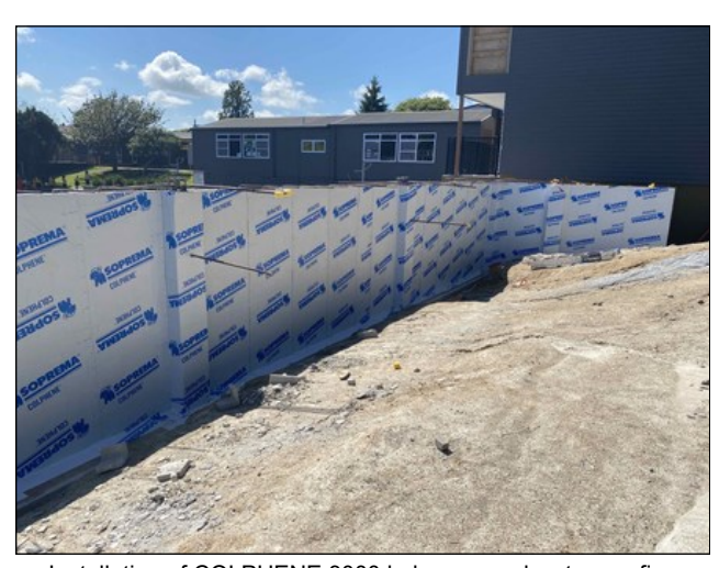
Installation of COLPHENE 3000 below-ground waterproofing

Email: info@equus.nz Website: www.equus.nz