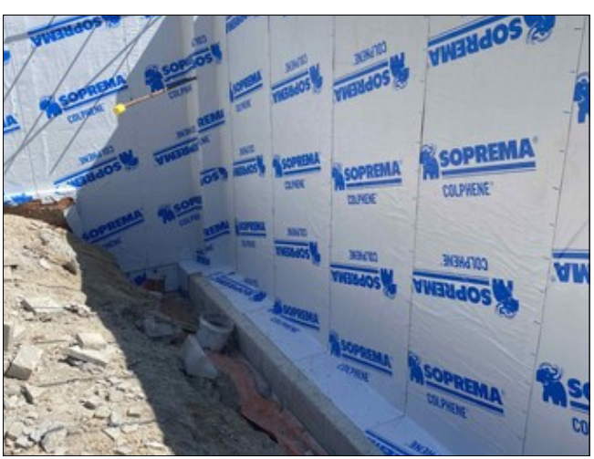
Completed wall waterproofing