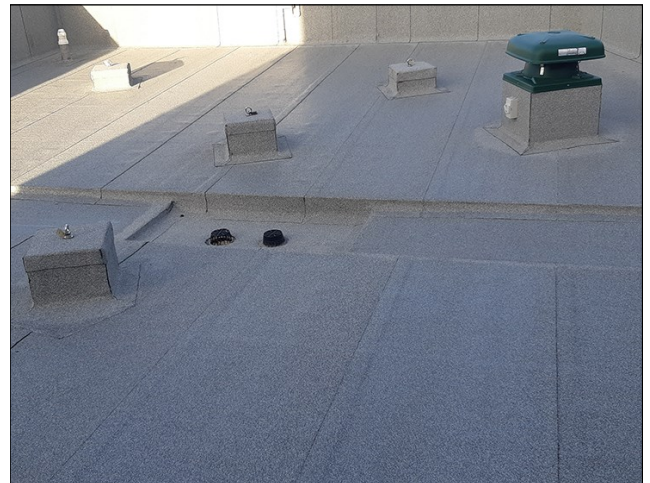
Completed Duotherm warm roof showing detailing