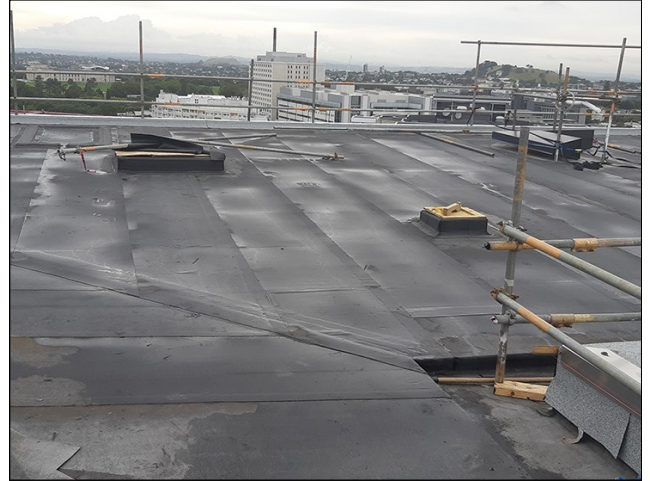
Installation of DuO base sheet over PIR