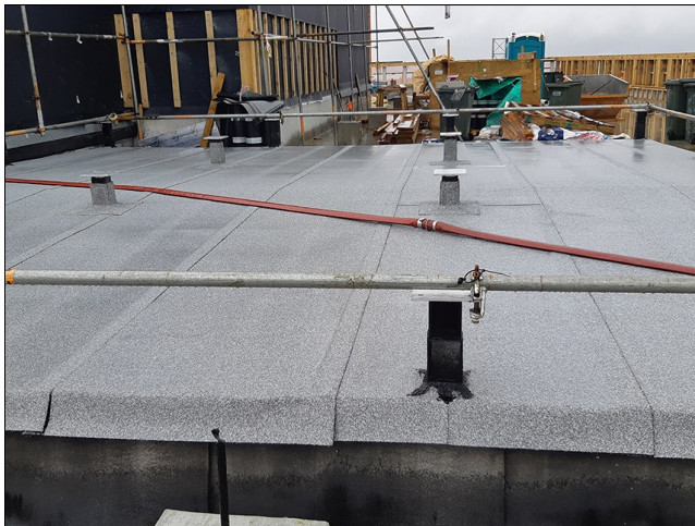
Installation of DuO cap sheet