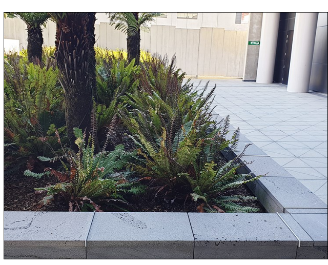
Planter boxes showing DuO Landscape membrane installation