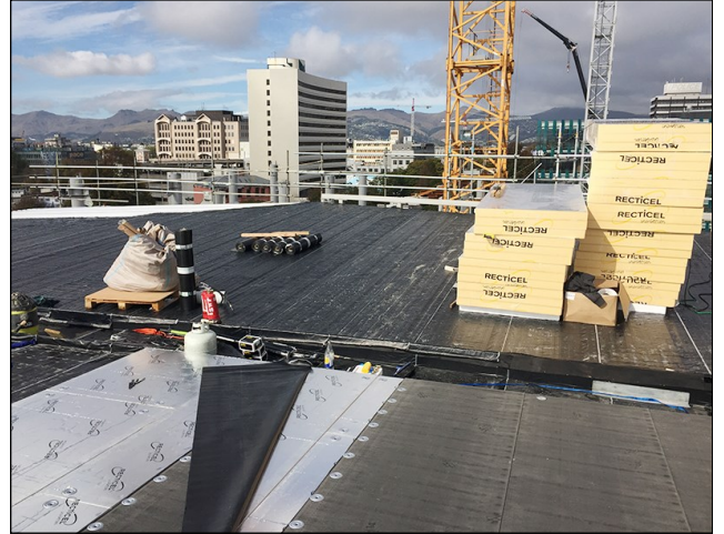
Installation of DuO base sheet over PIR