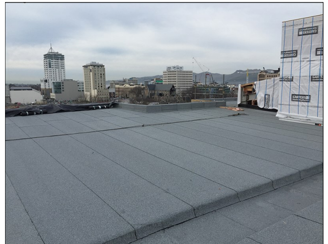
Completed DuO cap sheet installation