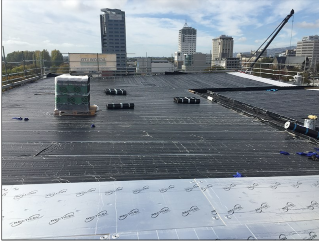
Installation of vapour barrier over steel substrate