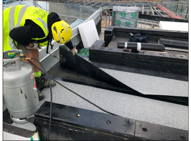
Installation of DuO cap sheet