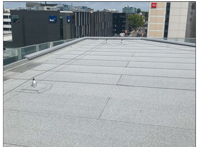
Completed Duotherm warm roof