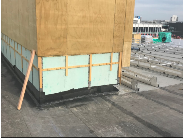
Installation of DuO base sheet