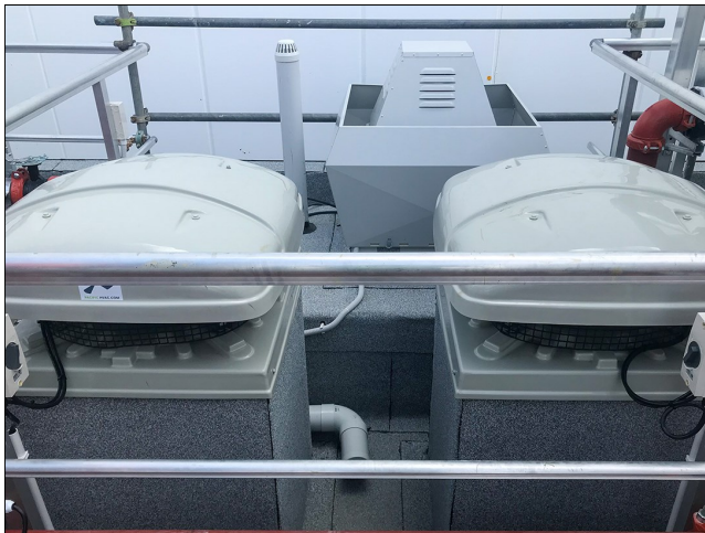
Installation of DuO membrane to details